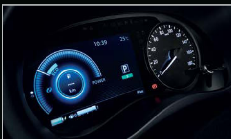
7" TFT Full Colour Digital Display