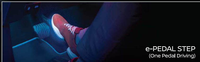
e-PEDAL STEP (One Pedal Driving)

*versus its equivalent ICE model (internal combustion engine)