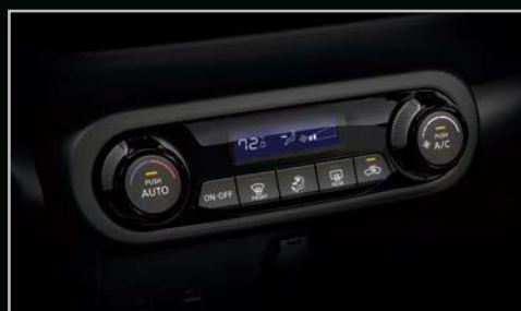
Automatic Climate Control Air-Conditioning