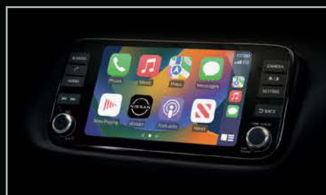
8" Infotainment System with Apple CarPlay™ and Android Auto™