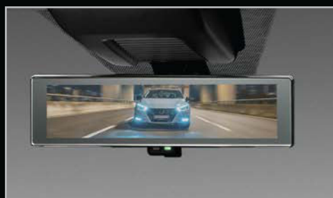
Intelligent Rearview Mirror (IRVM)