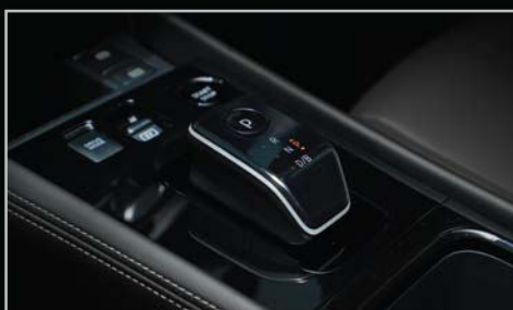
EV Style Centre Console with e-POWER Electronic Gear Shifter