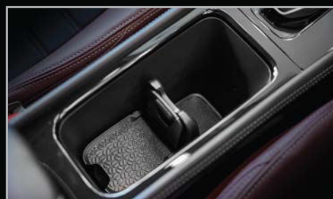
Centre Console Design with Adjustable Cupholders